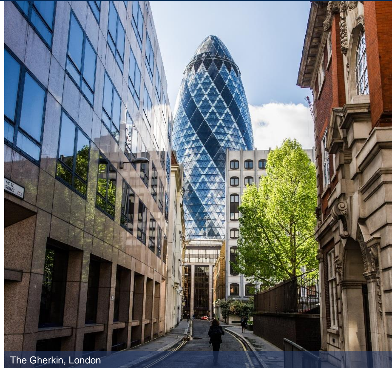
The Gherkin, London